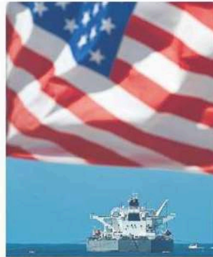
Iranian cargoes are now off the table entirely.

In mid-February, there were 20 million barrels of Russian