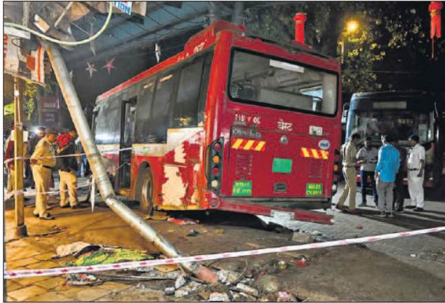
Four people were mowed down in December 2025 when the driver of a 12-metre-long e-bus failed to manoeuvre the vehicle outside a crowded Bhandup railway station.

There are 625 midi buses (9 metres long) run by wet-lease operators and 37 of the same size running as yellow col-