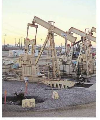
Crude oil output declined 1%, while electricity grew 0.6%.