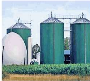
बायो गैस प्लांट।

गौरतलब है कि इस साल के बजट भाषण में वित्त मंत्री निर्मला सीतारमण ने गोबरधन योजना के तहत पूरे देश में पांच सौ बायो गैस