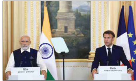
Prime Minister Narendra Modi with French Emmanuel Macron

"The talks with my friend, President @EmmanuelMacron were very productive. We reviewed the full range of India-France relations. I am particularly enthusiastic about deepening cooperation