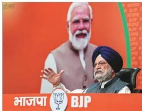
Union petroleum minister Hardeep Singh Puri addresses a press conference at the BJP headquarters to mark the Modi government's nine years in power

Addressing a press conference at the BJP headquarters here to mark the Modi government's nine years in power, Puri also attacked Rahul Gandhi for his remarks on Rafale and other issues, saying politics is all about credibility, and claimed that the