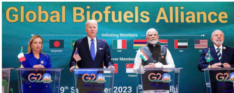
Italian Prime Minister Giorgia Meloni, US President Joe Biden, Prime Minister Narendra Modi and Brazilian President Luiz Inacio Lula da Silva at the launch of the Global Biofuels Alliance