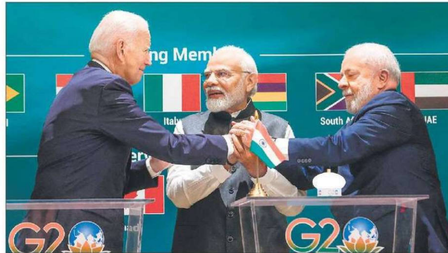
US President Joe Biden (left), Indian Prime Minister Narendra Modi and Brazilian President Luiz Inacio Lula da Silva at the launch of the Global Biofuel Alliance in New Delhi on Saturday.

The alliance is aimed at facilitating cooperation and intensifying the use of sustainable biofuels, including in the transportation sector. It will focus on strengthening markets, facilitating global biofuels trade, development of policy lesson-sharing and provision of technical support for national biofuels programs worldwide.