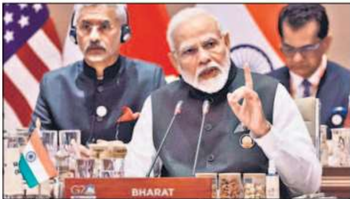
नई दिल्ली में शनिवार को एक सत्र के दौरान संबोधित करते प्रधानमंत्री नरेंद्र मोदी।

ग्रीन क्रेडिट इनीशिएटिव की शुरुआत होनी चाहिए : मोदी ने कहा कि पर्यावरण को ध्यान में रखते हुए दशकों से कार्बन क्रेडिट की भी चर्चा चल रही है। कार्बन क्रेडिट इस भावना पर बल देता है कि क्या नहीं करना चाहिए। यह एक नकारात्मक नजरिया है। इस कारण अक्सर इस बात पर ध्यान नहीं दिया जाता कि क्या सकारात्मक कदम उठाए जाने चाहिए। सकारात्मक कदमों