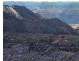
At present, India imports over 90% of its methanol requirement and 13-15% of its domestic ammonia needs

In category II, an outlay of ₹3,850 crore is provisioned for