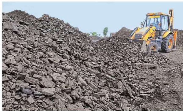
The push to leverage coal resources comes at a time when the Indian economy is projected to grow at 7%.

Coal gasification, the process by which coal is turned into fuel gas, is considered as a cleaner option than burning coal. The gas produced through the process can be used to produce gaseous fuels such as hydrogen, methane, methanol and ethanol among others. The high