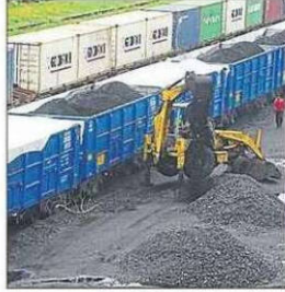
Under coal gasification process coal is turned into fuel gas. HT

India's green energy commitments involve reducing carbon emission intensity of its GDP by 45% by 2030 and installing 500