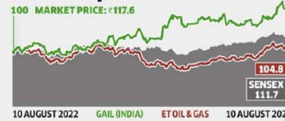
GAIL (India) is compared with ET OIL & GAS. Stock price and index values normalised to a base of 100.