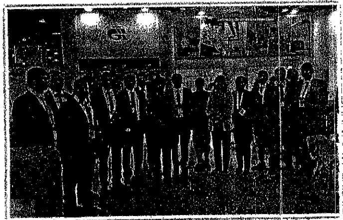
GAIL's team at one of the world's largest integrated gas, LNG and energy event - Gastech 2018 at Houston, USA

In order to promote transparency and accountability, an appropriate mechanism has been set up across the Company in line with the Right to Information Act, 2005. Your Company has nominated CPIO/ACPIOs/First Appellate Authorities and Nodal Officer at its units/offices across the Company to provide information to citizens under the provisions of the RTI Act.