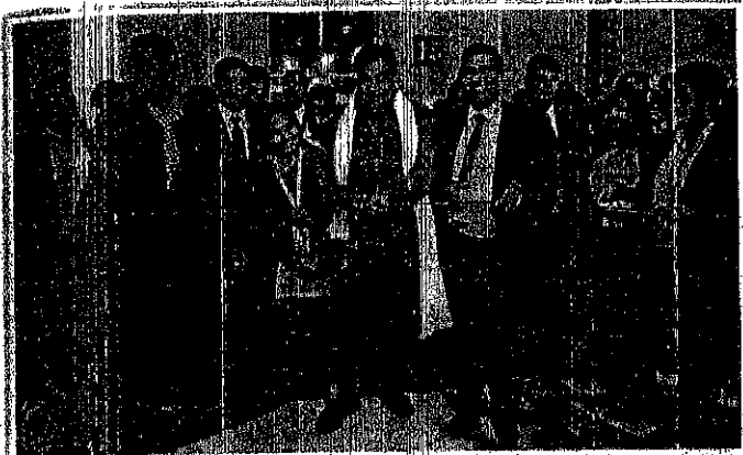
Sriji Nikh Gadkari, Hon'ble Union Minister, Road Transport and Highways and Micro, Small and Medium Enterprises inaugurated GAIL's stall at Auto Expo 2020