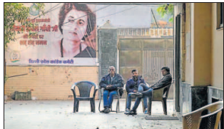
Delhi Congress office wears a deserted look on Wednesday.

The party's campaign against the Aam Aadmi Party and a reminder of the work done under the leadership of former chief minister Sheila Dikshit didn't resonate with people as its vote share plummeted to 11.68% from 21.09% in the 2017 municipal polls. However, the party's vote share increased from 4.26% in the 2020 assembly elections, largely due to the split in Muslim votes to the party won Chauhan Banger, Zakir Nagar, Abu Fazal Enclave, Kabir Nagar, Aya Nagar, Nihal Vihar, Shastri Park, Brij Puri and Mustafabad municipal wards. Of the nine wards, seven have a sizeable Muslim population. The Congress won northeast Delhi's riot-affected areas such as Chauhan Banger, Brij Puri, Mustafabad and Kabir Nagar with margins varying between 2,118 and 15,193. It also won south Delhi's Abu Fazal Enclave and Zakir Nagar, and east